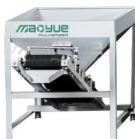
Metal separation loader