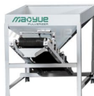
Metal separation loader