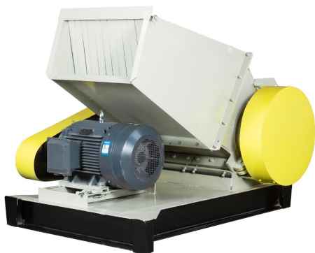
Plate crusher by adjusting the blade gap and the size of the screen mesh holes to meet the different waste crushing, can be the whole piece of plate into the realization of the second broken finished, and is equipped with an independent electric box control. It can also be equipped with crushing material transfer device, which is the first choice model for crushing wallboards and button boards.