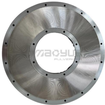
Integral Grinding Disc