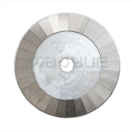
Split Grinding Disc